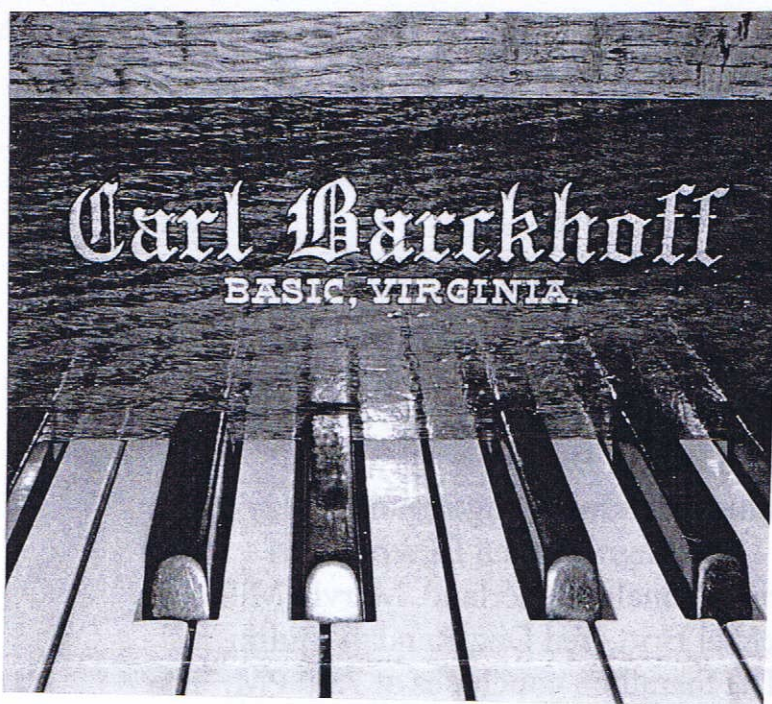
The Carl Barckhoff name board of the Woodsboro organ.